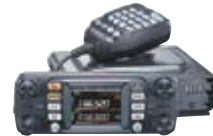
FTM-300DR C4FM/FM 144/430 MHz Dual Band