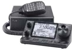
IC-7100 All Mode Transceiver