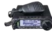
FT-891 HF+50 MHz All Mode Transceiver