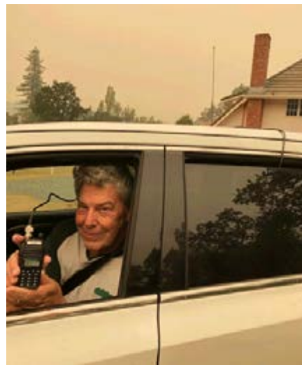
GMRS handheld attached to Mag-Mount GMRS antenna. Orange sky.

GMRS radios start under $50. My BTECH (Baofeng) cost $60. However, there is also a $70 license fee that lasts 10 years and is good for the whole family. This may be an obstacle for some; for most folks an FRS radio will suffice.