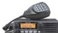
TM-281A 2 Mtr Mobile