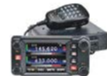
FTM-400XD 2M/440 Mobile